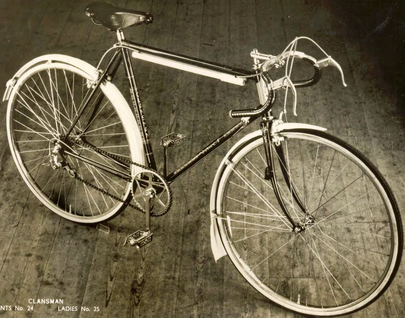
CLANSMAN GENTS No. 24 LADIES No. 25