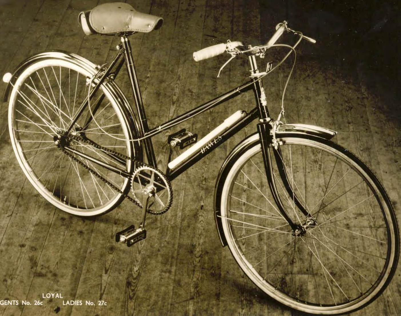
LOYAL GENTS No. 26c LADIES No. 27c