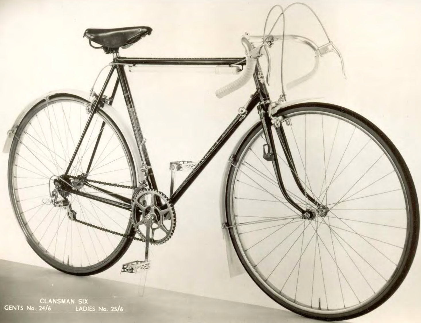
CLANSMAN SIX GENTS No. 24/6 LADIES No. 25/6