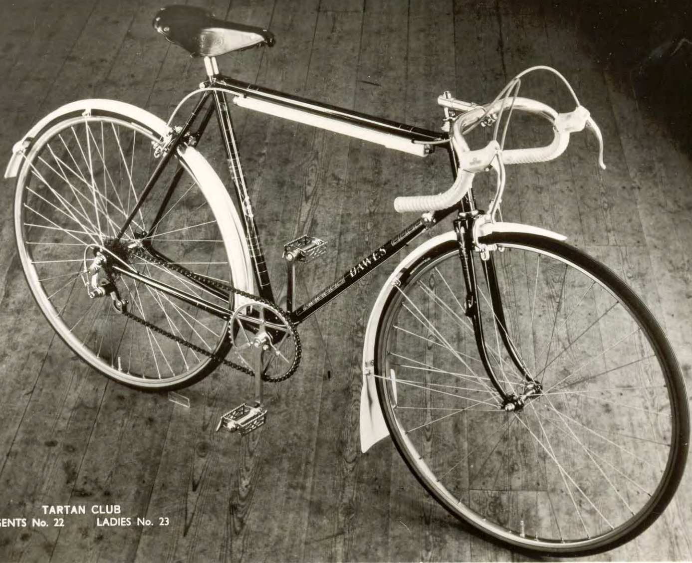
TARTAN CLUB GENTS No. 22 LADIES No. 23