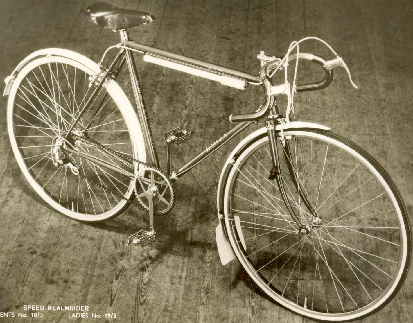
SPEED REALRIDER GENTS No. 18/3 LADIES No. 19/3