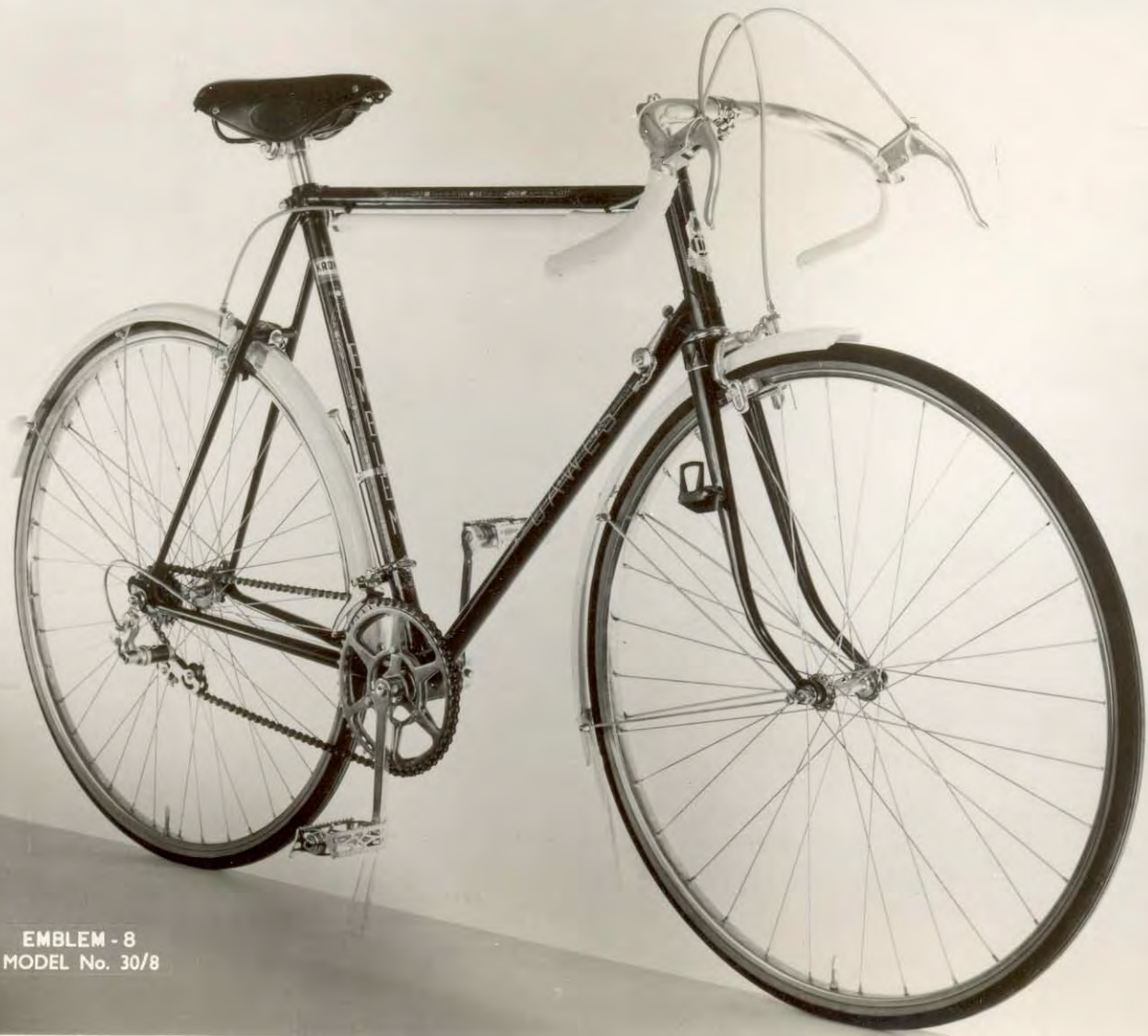
EMBLEM - 8 MODEL No. 30/8